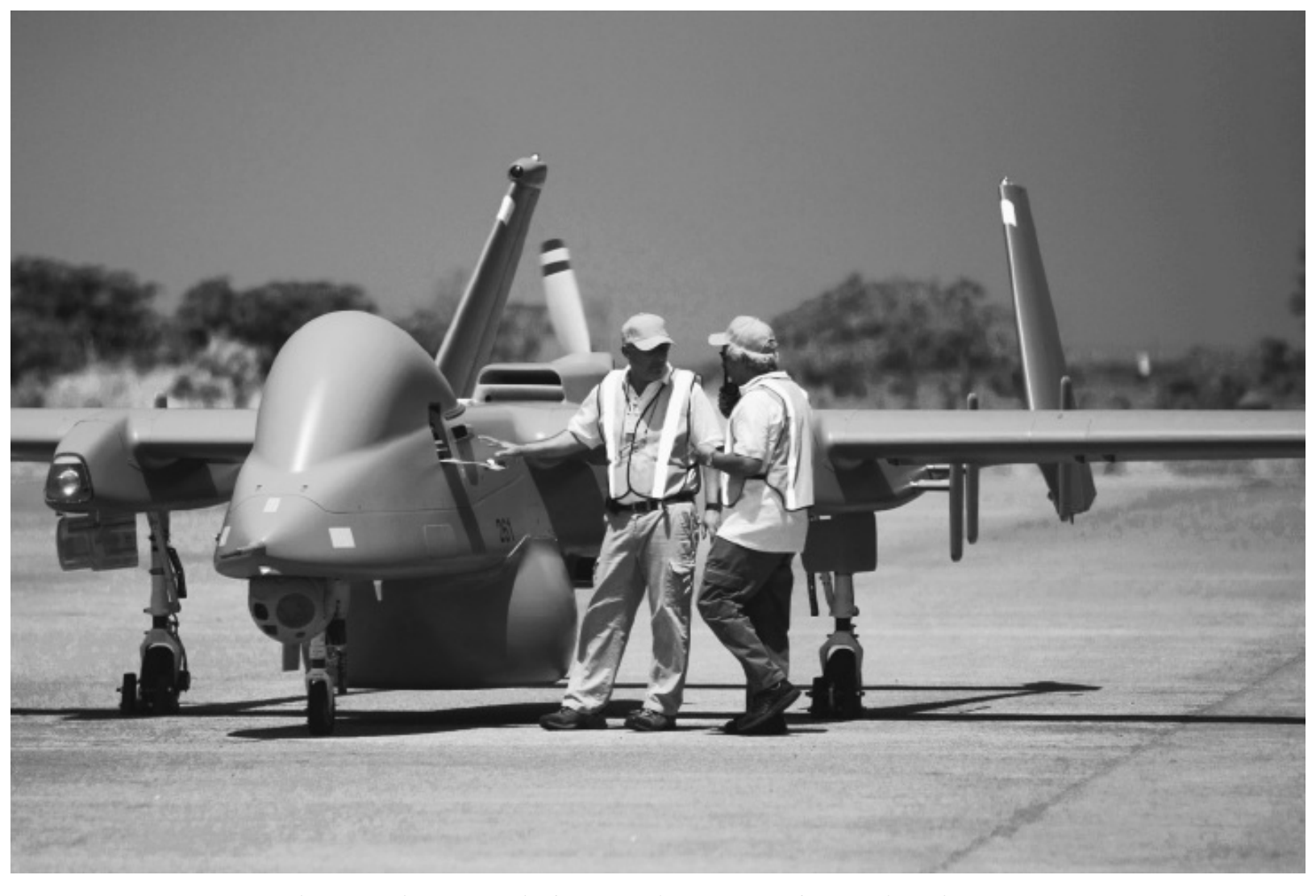
FIGURE 6.1. Heron drone.