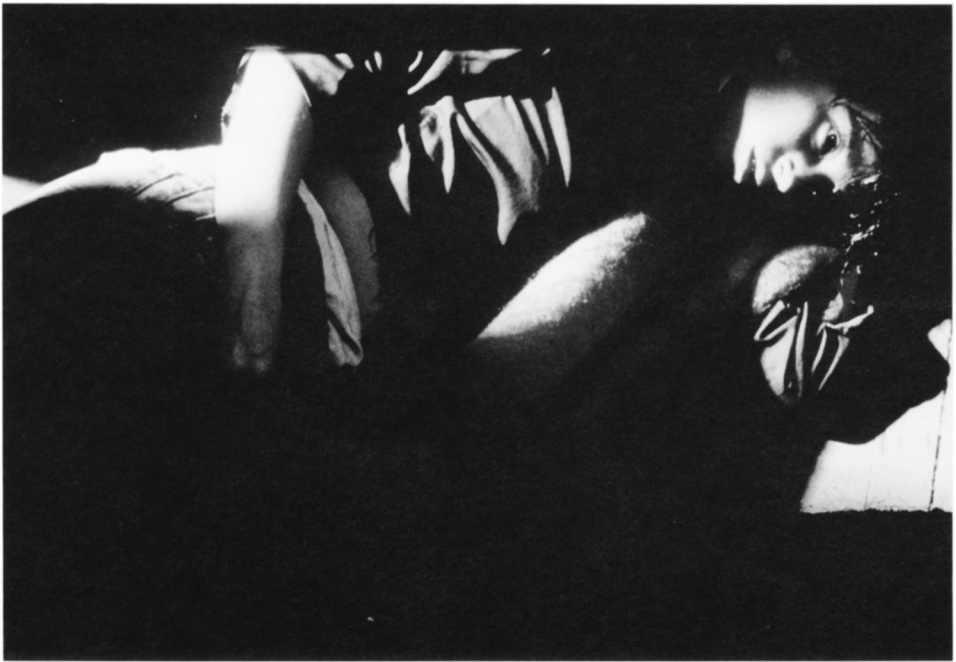
Cindy Sherman. Untitled #87. 1981.