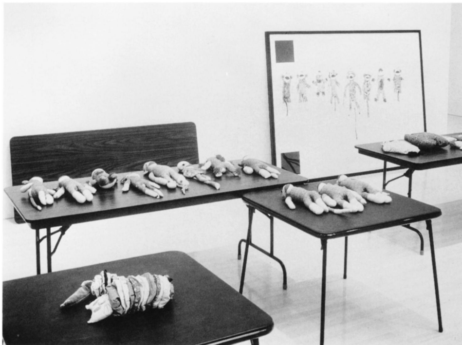
Mike Kelley. Craft Morphology Flow Chart. 1991.