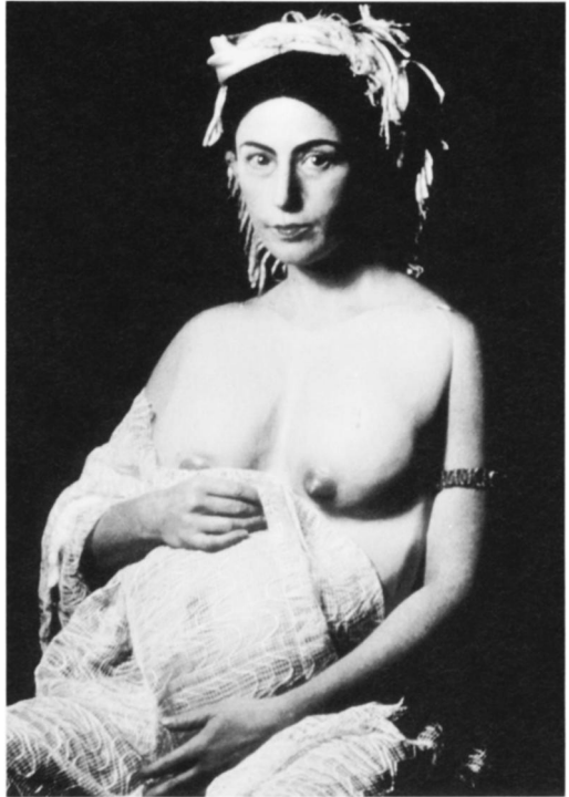
Cindy Sherman. Untitled #205. 1989.