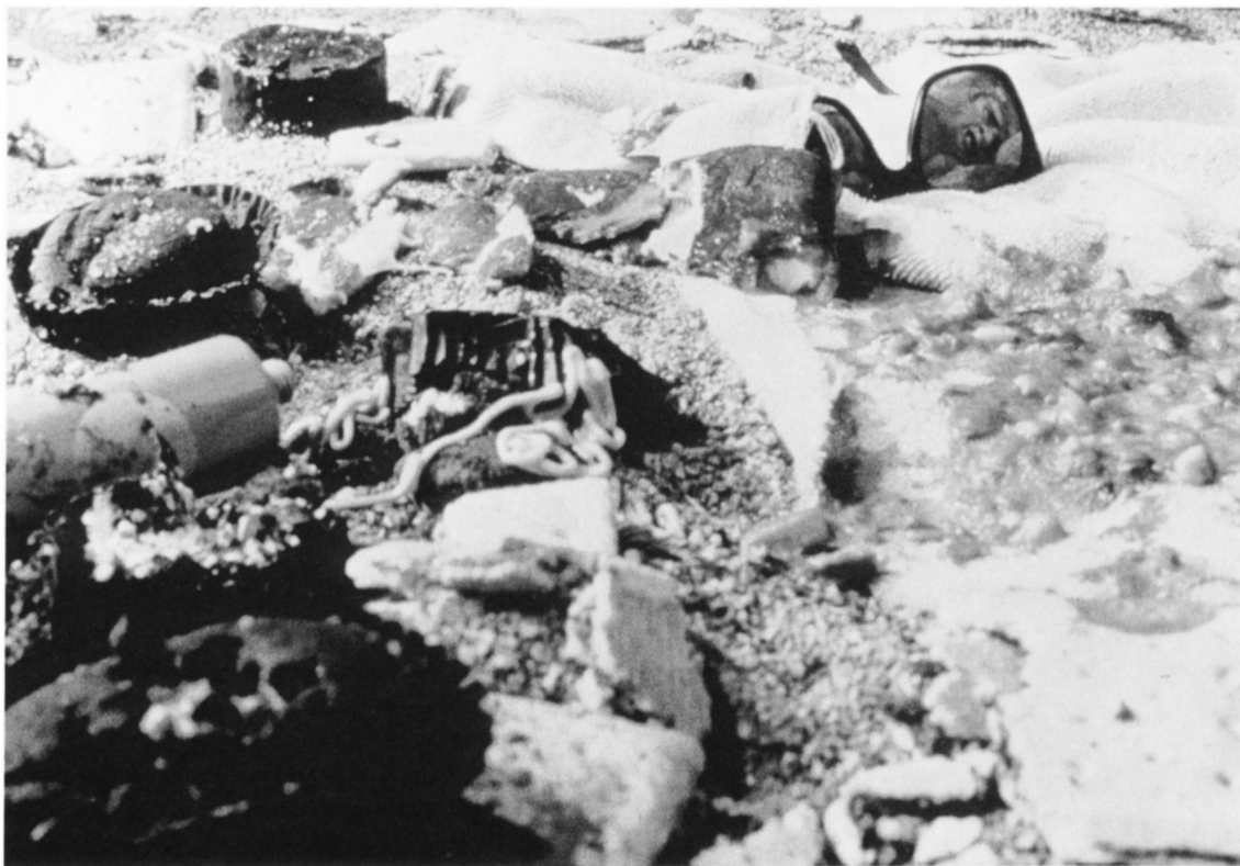
Cindy Sherman. Untitled #175. 1987.